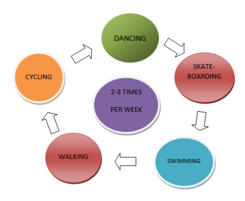
Fig 1. Recreational physical activity applications for children with disabilities

Your children with disabilities should aim to take part in at least one hour of medium to hard intensity physical activity every day. Bu süreler If your child has a disability or medical condition, activities and exercises should be adapted according to what they can do. Example physical activity applications (https://www.physiopedia.com, 2019) (Fig.1)